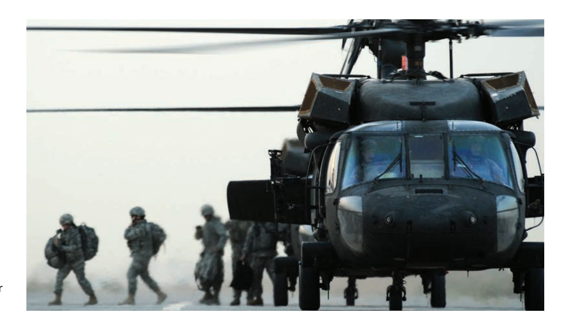
The UH-60 Black Hawk performs a wide range of missions, including the tactical transport of troops and aeromedical evacuation around the world. Donaldson products are key to their successful operation.

Donaldson Company, Inc. is a leading worldwide manufacturer of filtration systems and replacement parts. Our product mix includes air and liquid filters and exhaust and emission control products for mobile equipment; in-plant air cleaning systems; air intake systems for industrial gas turbines; and specialized filters for such diverse applications as computer disk drives, aircraft passenger cabins and semiconductor processing. Products are manufactured at more than three dozen manufacturing facilities around the world.