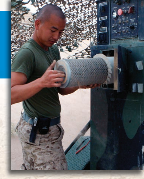
Changing filters is a user-friendly process.