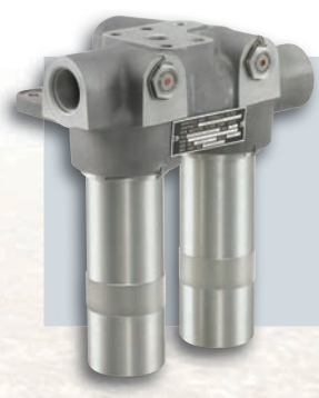
Hydraulic manifolds preserve precious space.

Self-cleaning filtration like PJAC<sup>™</sup> reduce vehicle down time and increase filter element life.